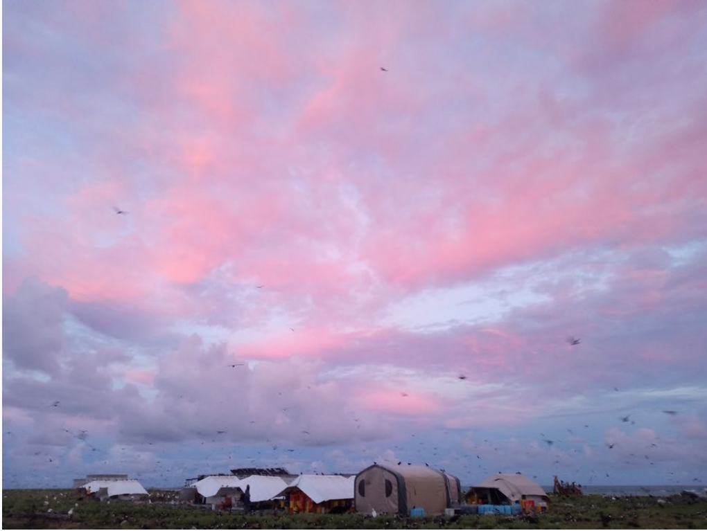
Field camp at Tern Island, Lalo, and sunrise.