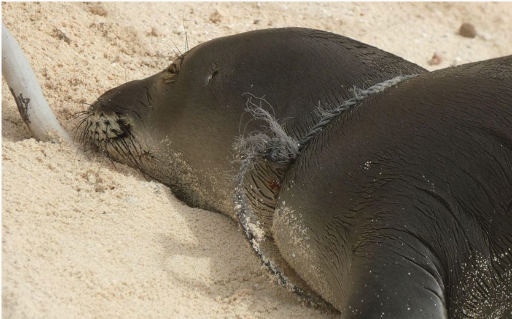
Entangled weaned pup at Kapou immediately prior to disentanglement.