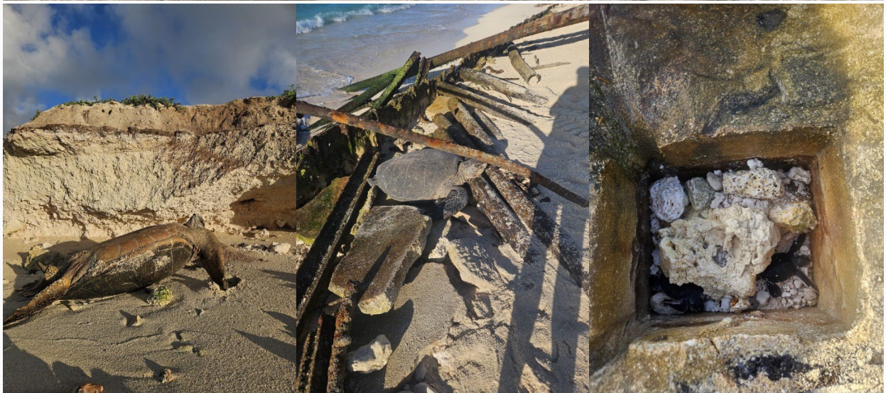
Green sea turtles (honu) entrapped (or being released) from various hazards throughout Tern Island.