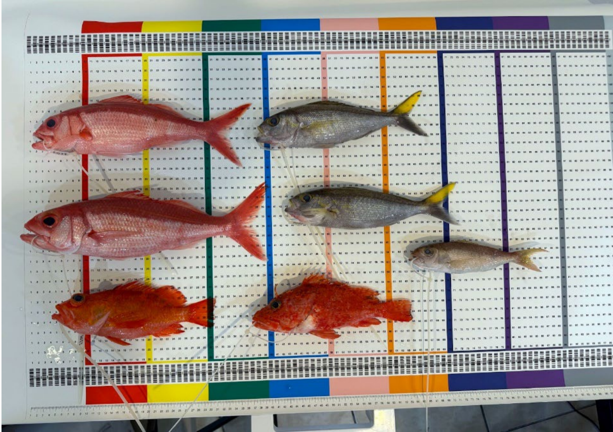
Guam biosampling program using a fish mat to measure fish caught from Guam BFISH a mixed composition catch of bottomfish, including buninas agaga 1 , buninas, and incidental catch of the Large-Head Scorpion Fish ( Pontinus macrocephalus ) and a rare Perchlet.